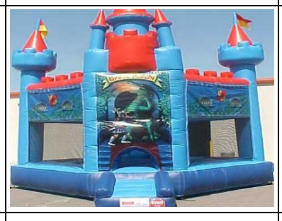
Brave Knight 15 x 15' 250 lbs. $103.59 per day