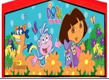
Combo Challenge Art Panel Dora The Explorer