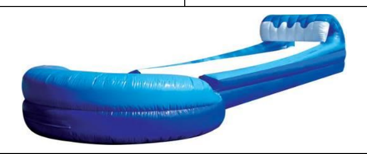
California Wave Slip & Slide 35 x 11' 200 lbs. $159.38 per day