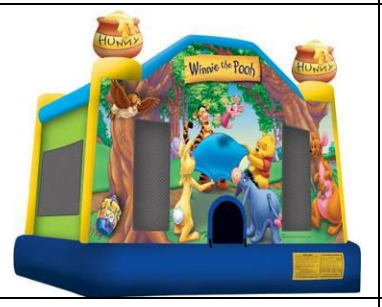
Winnie the Pooh 13 x 13' 200 lbs. $79.69 per day