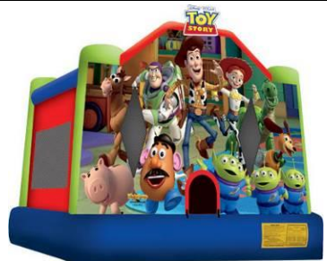
Toy Story 13 x 13' 200 lbs. $79.69 per day