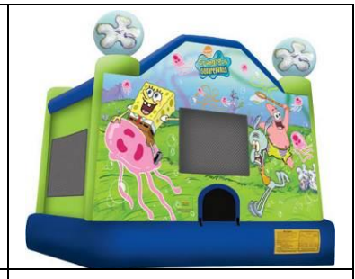
Sponge Bob 13 x 13' 200 lbs. $79.69 per day