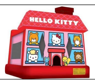
Hello Kitty 13 x 13' 200 lbs. $79.69 per day