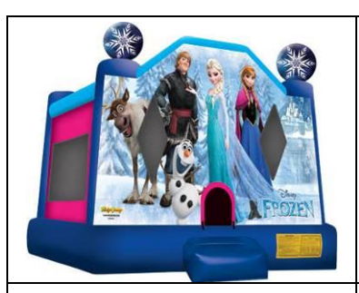
Frozen 13 x 13' 200 lbs. $79.69 per day