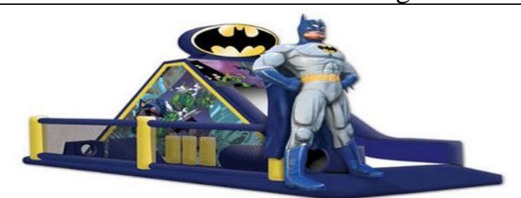
Batman Challenge 31 x 16' 485 lbs. $239.06 per day