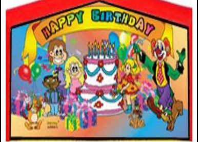
Combo Challenge Art Panel Clown Happy Birthday