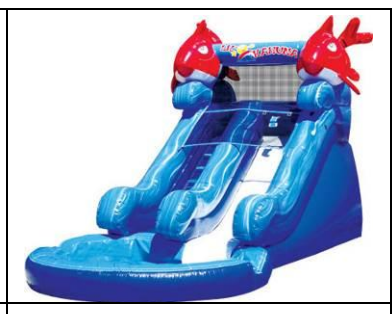
Lil' Kahuna Wet Slide 19 x 10' 170 lbs. $119.53 per day