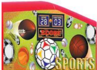
Combo Challenge Art Panel Sports