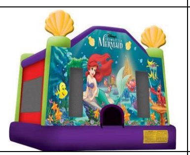
Little Mermaid 13 x 13' 200 lbs. $79.69 per day