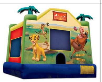
Lion King 13 x 13' 200 lbs. $79.69 per day