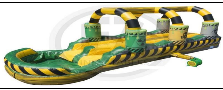
Hazardous Rapids Slip & Slide 30 x 10° 250 lbs. $159.38 per day