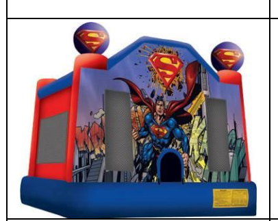
Superman 13 x 13' 200 lbs. $79.69 per day