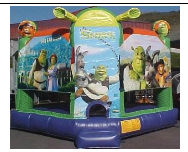
Shrek 15 x 15' 250 lbs. $103.59 per day