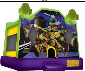
Teenage Mutant Ninja Turtles 2 13 x 13' 200 lbs. $79.69 par day