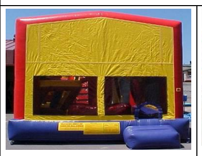
Combo Challenge 15w x 19d x 16h' – 325 lbs. $159.38 per day