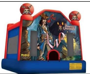
Pirates of Caribbean 13 x 13' 200 lbs. $79.69 per day