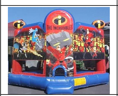
Incredibles 15 x 15' 250 lbs. $103.59 per day