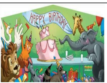
Combo Challenge Art Panel Animal Happy Birthday