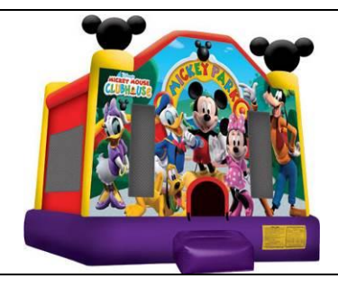
Mickey Park 15 x 15' 250 lbs. $103.59 per day