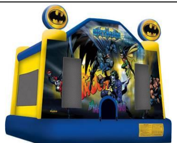
Batman 13 x 13' 200 lbs. $79.69 per day